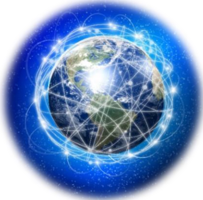
International Networking Telemedicine Bioinformatics