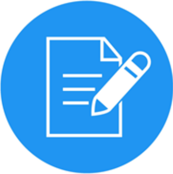
Reporting SPORT ASSAY